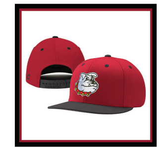
CULVER RED SNAPBACK HAT $12.00 S - M/L