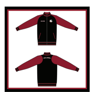
WOMEN'S TRACK JACKET A - $50.00 Adult: XS - S - M - L - XL