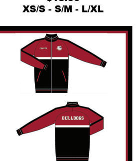
TRACK JACKET $50.00 Youth: S - M - L - XL Adult: S - M - L - XL