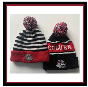
CULVER BEANIE HAT $10.00 One Size Fits All