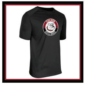
C. BULLDOGS BLACK T-SHIRT $12.00 Youth: S - M - L - XL Adult: S - M - L - XL