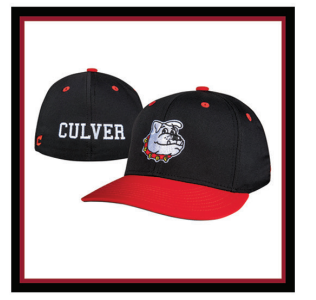
CULVER BLACK FITTED HAT $18.00 XS/S - S/M - L/XL