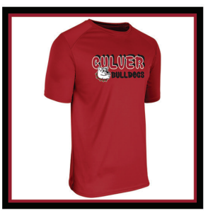
C. BULLDOGS RED T-SHIRT $12.00 Youth: S - M - L - XL Adult: S - M - L - XL

To purchase spirit wear visit <u>https://culverschoolpta.memberhub.com/store</u>