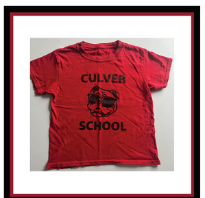
BULLDOG T-SHIRT $5.00 Youth: XS - S - M - L - XL