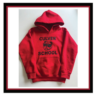
BULLDOG HOODIE $20.00 Youth: XS - S - M - L - XL Adult: S - M - L - XL