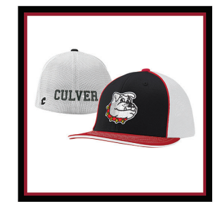
CULVER WHITE FITTED HAT $18.00 XS/S - S/M - L/XL